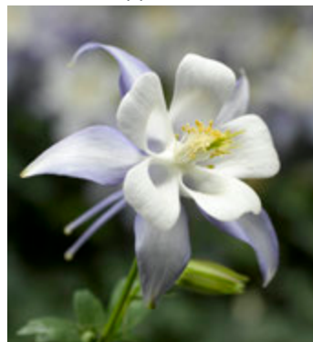
Kirigami™ Light Blue and White Product ID: 70059724