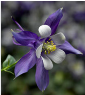
Kirigami™ Deep Blue and White Product ID: 70059727