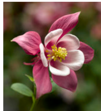
Kirigami™ Rose and Pink Product ID: 70059715