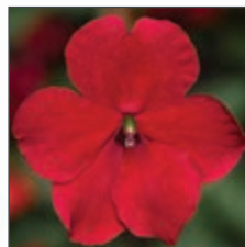
Imara™ XDR Red 70078040