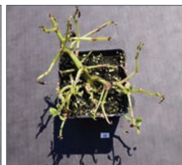
Leading non-resistant competitor violet