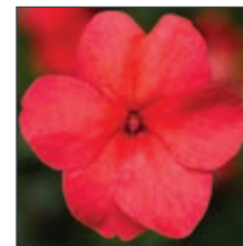
Imara™ XDR Salmon Shades 70078043