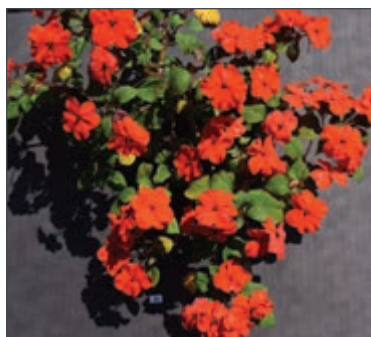
Imara™ XDR Orange