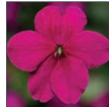
Imara™ XDR Purple 70078047