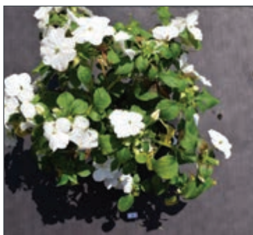
Imara™ XDR White