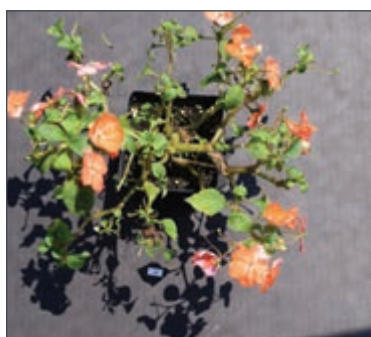
Leading non-resistant competitor orange