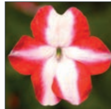
Imara™ XDR Orange Star 70072427