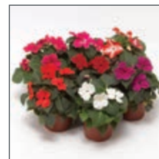
Imara™ XDR Mix 70082997