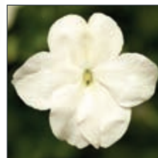
Imara™ XDR White 70072429