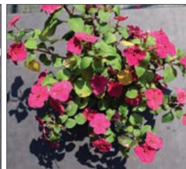
Imara™ XDR Purple