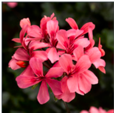
Caldera™ Salmon 70065939