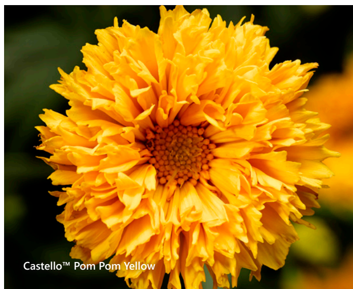
Castello™ Pom Pom Yellow

Daily light integral: 4–6 \text{mol}\cdot\text{m}^{-2}\cdot\text{d}^{-1} for the first two weeks after sticking or until root development occurs. DLI can be increased to greater than 12 \text{mol}\cdot\text{m}^{-2}\cdot\text{d}^{-1} after root formation.