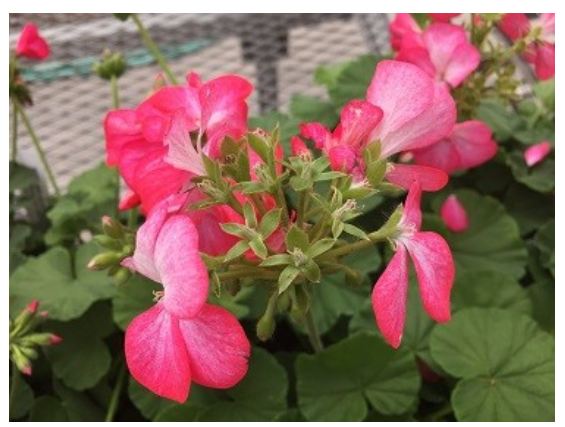
Control (no treatment)