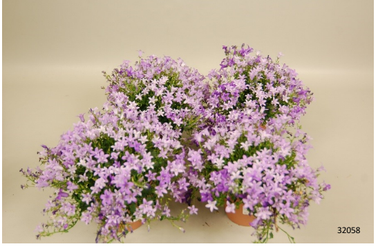
Chrysal Alesco + LeafShine & Seal