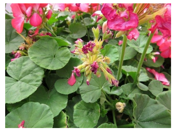
Control (no treatment)