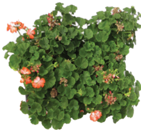
Pinto™ Premium Orange Bicolor Geranium