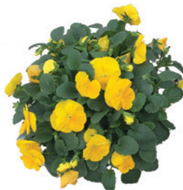
Delta™ Pro Clear Yellow Pansy