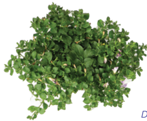
Dekko™ Sky Blue Petunia